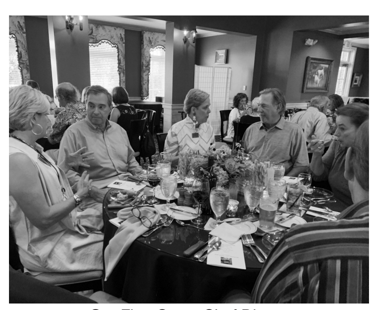
Our First Guest Chef Dinner

All food and beverage must be purchased from the Club. No outside food or beverage is permitted.