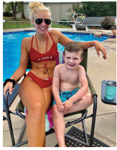
Pool Closes Sunday, September 8